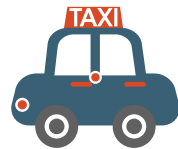
사진 좀 찍어주실 수 있나요?